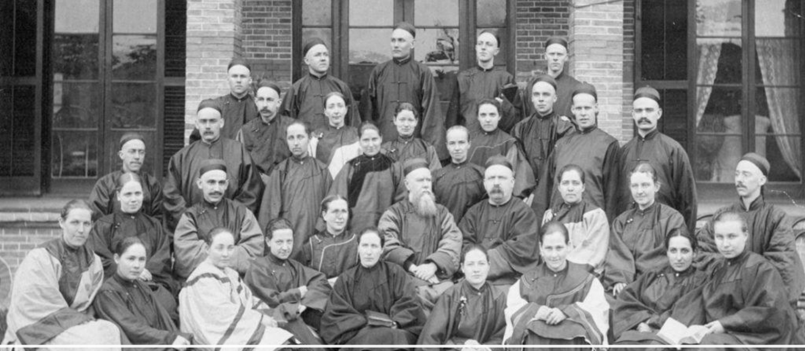
Hudson Taylor and China Inland Mission